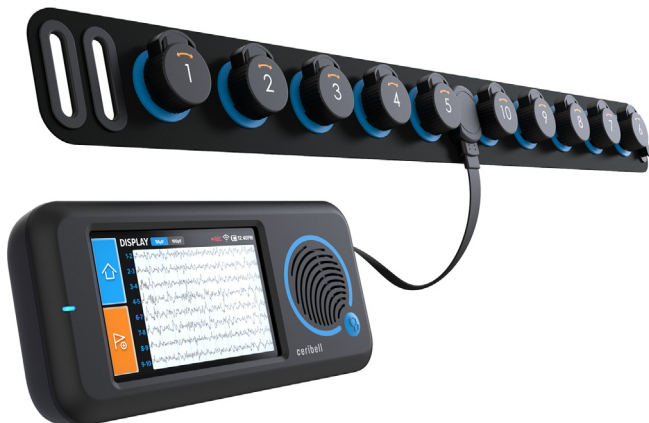
Fig. 1. The rapid response EEG system consisting of a portable EEG recorder and a disposable electrode headband.

In this test, a full system comparison was made with simultaneous recordings on a healthy adult female subject with usual hair