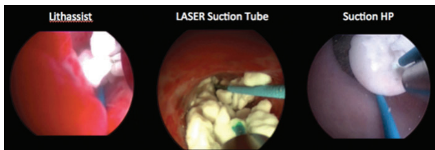
FIG. 2. Comparison of suction channel and laser configurations between LSHP.

Although our experience in an animal model suggests that stone fragmentation at the time of PCNL using LSHP is feasible, several limitations may impact its widespread acceptance. First, the mechanics of such devices, namely a small bore suction tube (11–12F), limit the ability to evacuate larger stone fragments. In the LASER Suction Tube and LithAssist models, the effective luminal size is even more diminished by laser fiber insertion, a problem avoided by the laser insertion mechanism of the Suction HP device, which