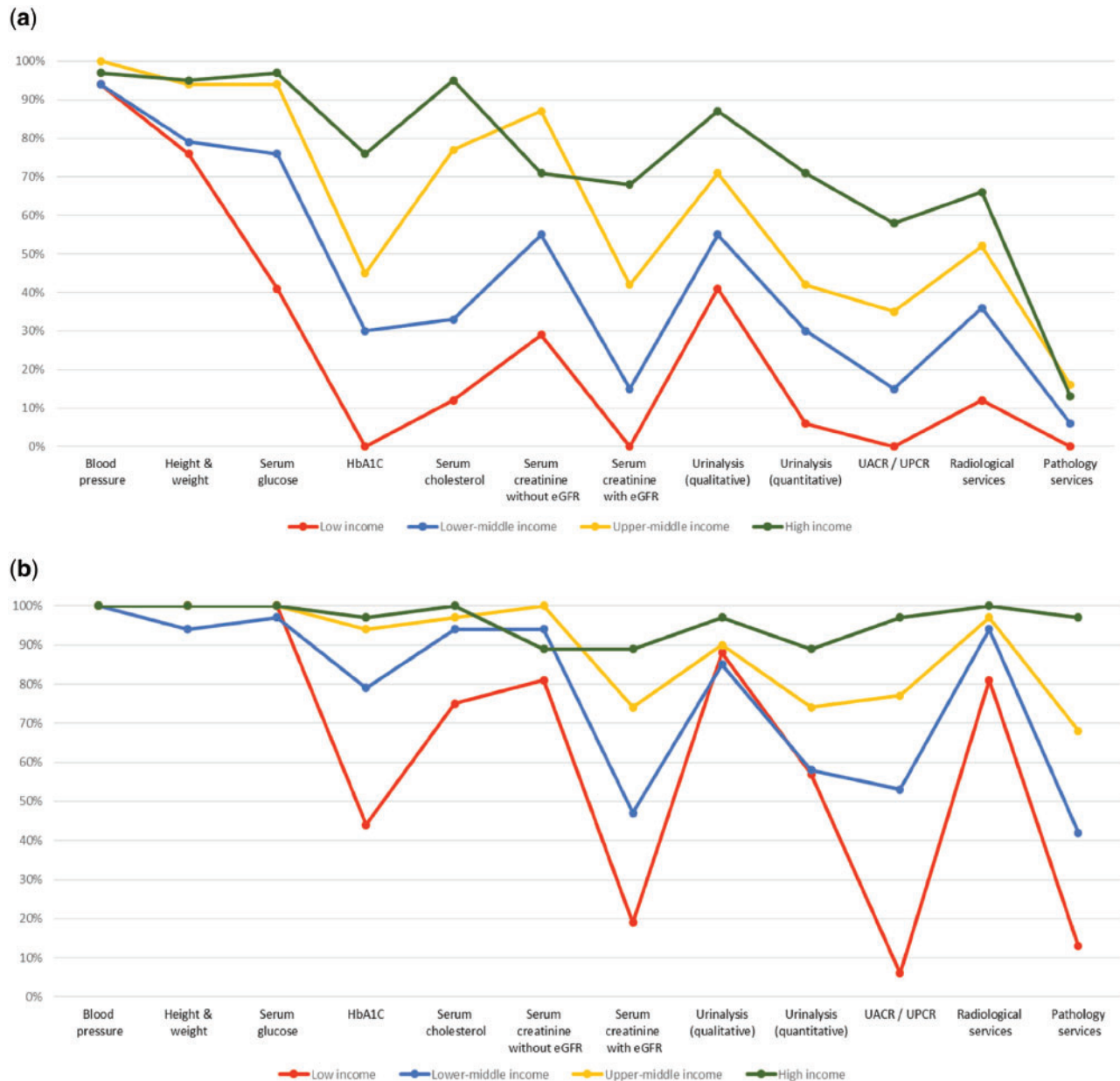
FIGURE 1: Health care services for identification and management of chronic kidney disease by country income level. (a) Primary care (i.e., basic health facilities at community levels [e.g., clinics, dispensaries, and small local hospitals]). (b) Secondary/specialty care (i.e., health facilities at a level higher than primary care [e.g., clinics, hospitals, and academic centers]). eGFR, estimated glomerular filtration rate; HbA1C, glycated hemoglobin; UACR, urine albumin-to-creatinine ratio; UPCR, urine protein-to-creatinine ratio. Data from Bello et al. [4] and Htay et al. [45].

in low-income regions. For instance, more than 90% of upper-middle-income and high-income countries reported having chronic peritoneal dialysis services, whereas these services were available in 64% and 35% of low-income and lower-middle-income countries, respectively. In comparison, acute peritoneal dialysis had the lowest availability across all countries. More than 90% of upper-middle-income and high-income countries reported having kidney transplant services, with more than 85% of these countries reporting both living and deceased donors as the organ source. As expected, low-income