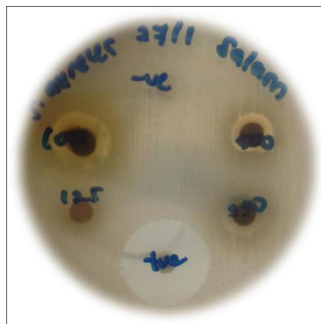
Figure-2: Growth zone of inhibition of some of the bacteria ( Staphylococcus aureus ) caused by Syzygium polyanthum extract.

The S. polyanthum extract shows the largest zone of inhibition at 1000 mg/ml concentration against S. aureus which was 13.5 mm in diameter. The sensitivity reduced as the concentration of plant extract decreased. The treatment effect was time-dependent manner. When compared to the positive control, S. hyicus was the most sensitive toward amoxicillin followed by S. aureus and S. intermedius . On the other hand, 3% DMSO which was used as negative control also failed to inhibit any bacteria.