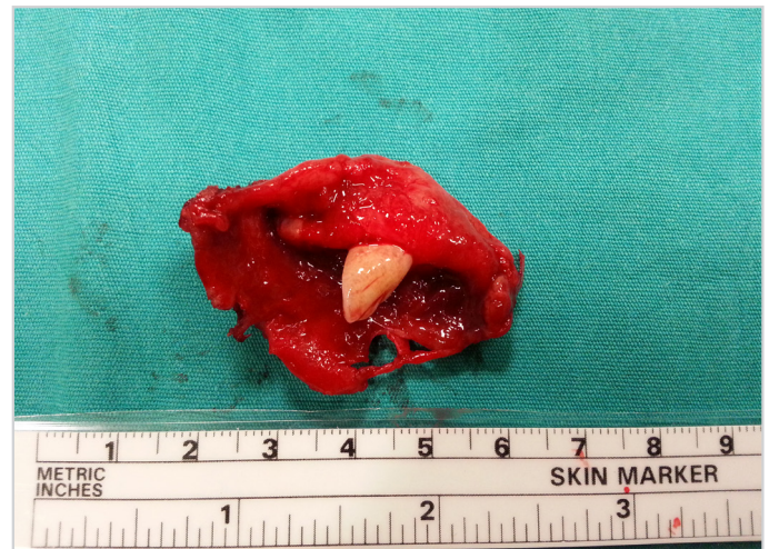
Figure 4. Post-operative view of the specimen consisting of a cyst with a small monoradicular supernumerary tooth