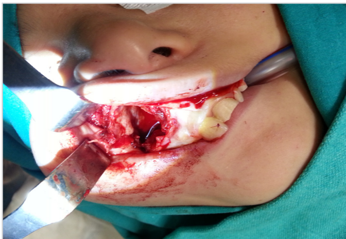
Figure 2. Defective anterior maxillary wall, destroyed by cyst expansion