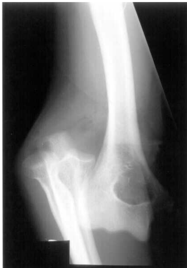
Figure 2 Postero-anterior radiograph of right elbow showing an antero-lateral dislocation

In our patient the medial collateral ligament was found to be disrupted at operation. Thus, the injury had also involved the medial column, dislocating the joint in an antero-lateral direction. Most authors recommend accelerated functional treatment for simple elbow dislocations [7], as long periods of immobilisation have not been found to be of any benefit [8]. Surgical repair of the ligaments has been advocated, but there is little evidence that the results of surgical repair of the ligaments are any better than those of non-surgical treatment [9]. This case highlights the possibility of sustaining an extensive soft tissue damage after a minor injury and illustrates how excellent functional outcome can be achieved with a conservative approach in this situation.