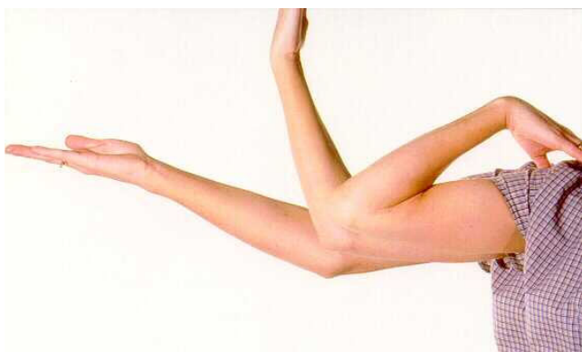
Figure 4 Clinical photograph showing the range of movements achieved on the injured elbow six months after injury