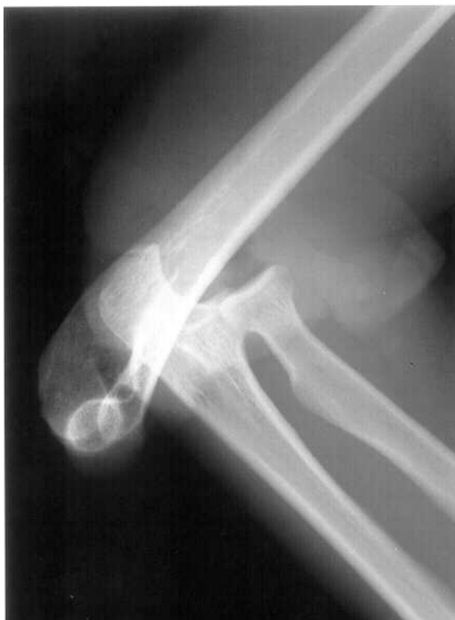
Figure 3 Lateral radiograph of right elbow showing an antero-lateral dislocation