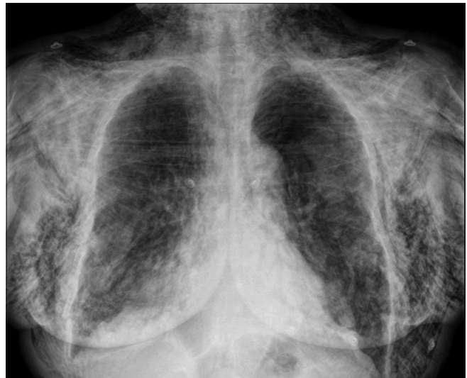
Figure 1: Chest X-ray on the day of admission showing vast subcutaneous emphysema. Pneumothorax and pneumomediastinum are obscured by the extensive subcutaneous air.

The patient evolved favorably after oxygen therapy, antibiotic prophylaxis, and conventional medical treatment. Seven days later, subcutaneous emphysema had almost resolved spontaneously on the follow-up chest X-ray [Figure 3].