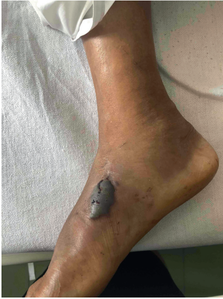
FIGURE 2: A bulla and tissue necrosis at the site of bite and edema of the right foot (day 6).