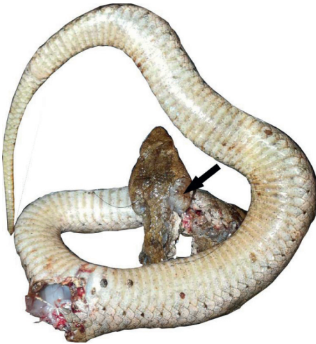
FIGURE 3: The offending snake. Large venom glands can be seen (pointed by an arrow). The pattern of scales in the dorsum of the head also contributed to positive identification of the species.

calcium level was low (1.8 mmol/l). Last two seizures were attributed to hypocalcemia due to chronic kidney disease following HNV envenomation, and daily calcium carbonate dose was increased to 500 mg thrice daily. After three months, she was diagnosed of end-stage renal disease by nephrology team and on hemodialysis once in four days and was searching for a kidney donor at six months.