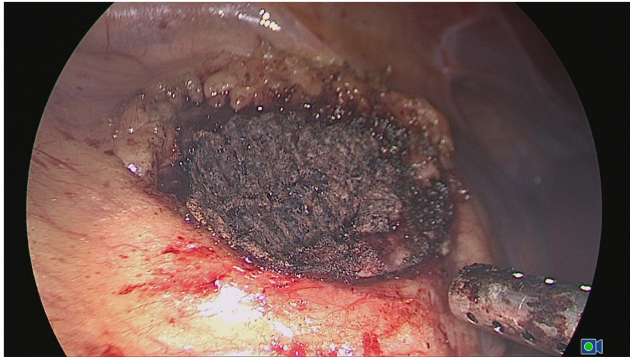
Fig. 1 Repeated coagulation to form a helmet-like eschar helped maintain hemostasis

A total of 98 patients received NBCA intraoperatively, and 44 did not. The details are shown in Table 2. Patients receiving NBCA had larger tumors (3.0 vs 2.0 cm, p < 0.001 ), higher RENAL nephrometry scores (5.59 vs 4.47, p = 0.004 ), higher E item scores ( p = 0.009 ), than did patients not receiving NBCA.