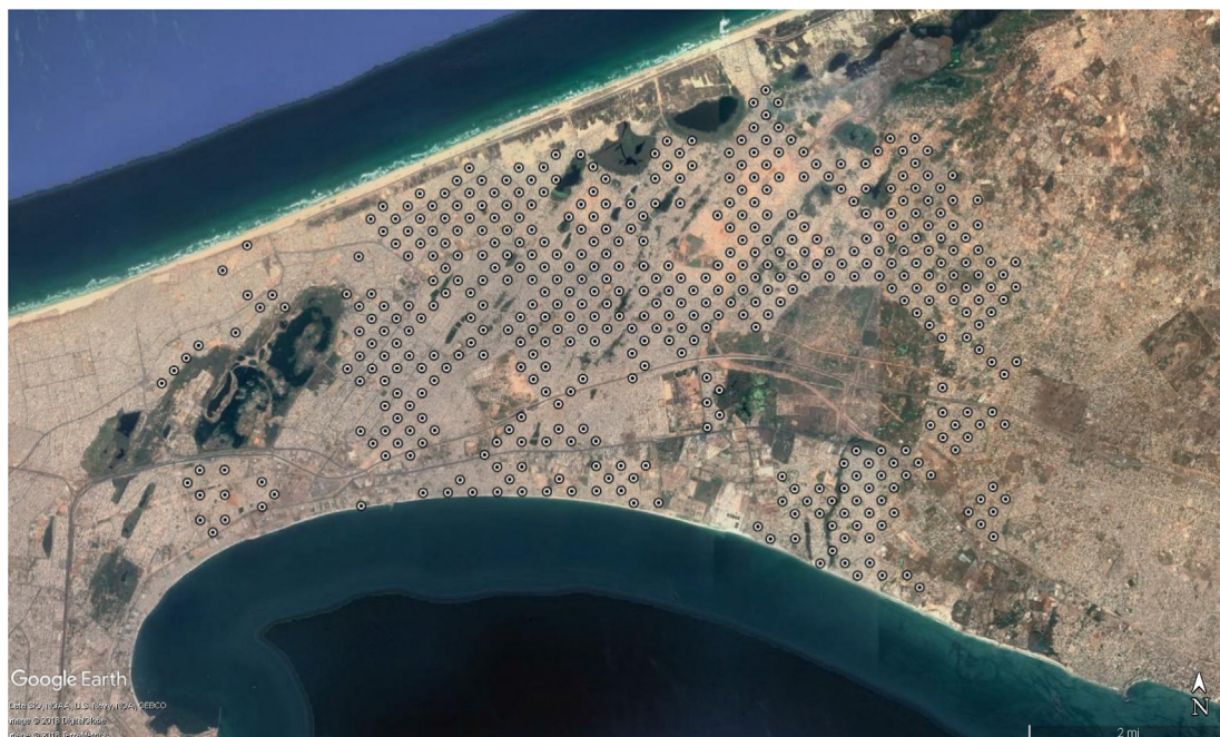
Fig. B-1. Map of gridpoints used as starting point for each neighborhood.