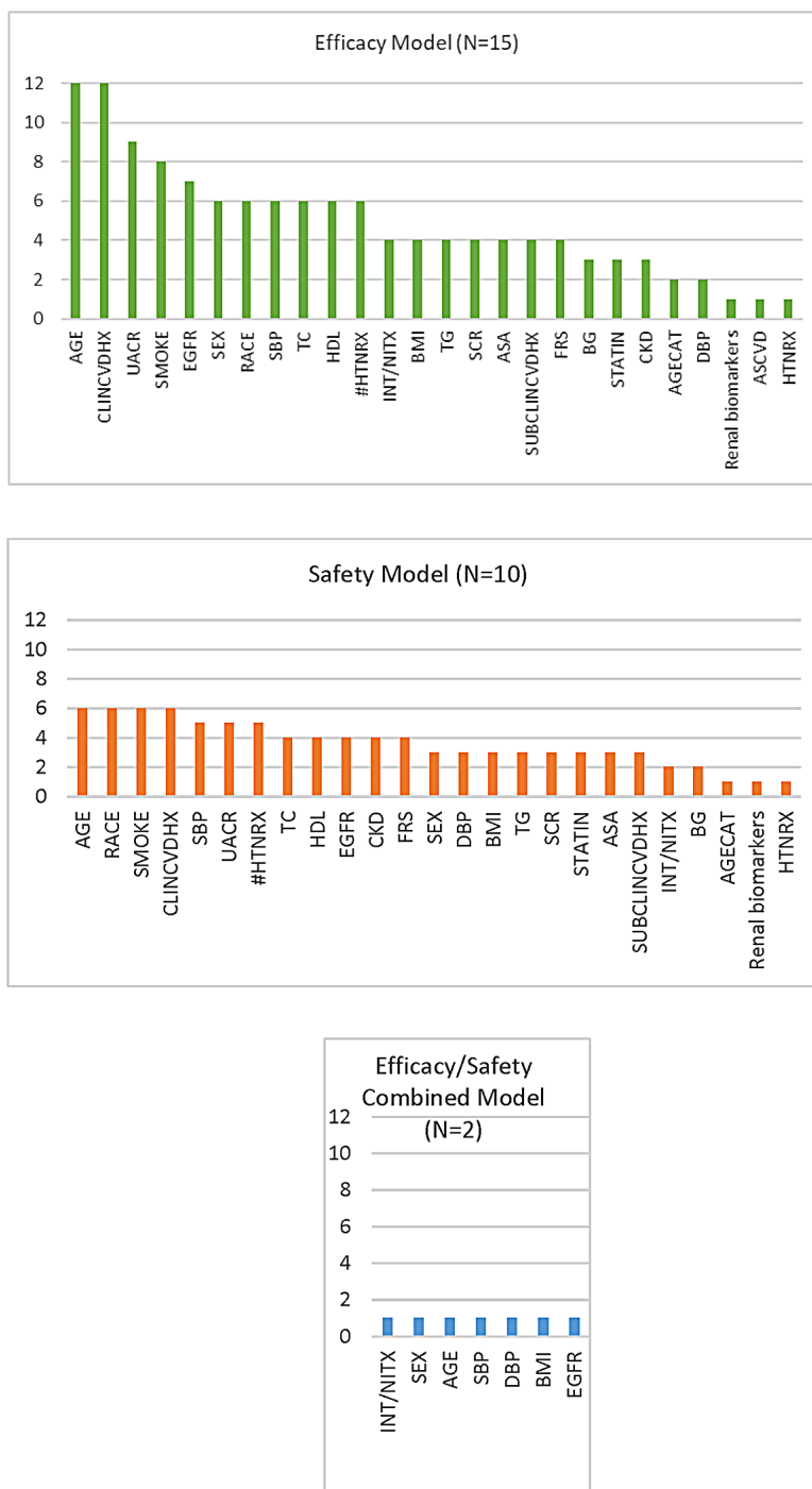
Figure 2 This figure is a bar chart that shows the frequency of variables included in the efficacy, safety and combined efficacy/safety models for the submissions included in the systematic evaluation. The x-axis lists the variables (with abbreviations defined in the footnote) and the y-axis shows the number of models that included each variable in their final prediction models. AGECA, age category; ASA, daily aspirin use; ASCVD, atherosclerotic cardiovascular disease risk; BG, serum glucose; BMI, body mass index; CKD, indicator of eGFR <60 mL/min/1.73m 2 ; CLINCVDX, history of clinical cardiovascular disease; DBP, diastolic blood pressure; EGFR, estimated glomerular filtration rate; FRS, indicator whether 10-year Framingham Risk Score is >15%; HDL, high-density lipoprotein cholesterol; HTNRX, number of distinct antihypertensive agents prescribed; INT/NITX, treatment assignment (either intensive or standard treatment); SBP, systolic blood pressure; SCR, serum creatinine; STATIN, on any statin medication; SUBCLINCVDX, history of subclinical cardiovascular disease; TC, total cholesterol; TG, triglycerides; UACR, urine albumin/creatinine ratio.

approaches. Our systematic evaluation highlights the diversity of approaches that may be taken to solve the same problem, under the same rules of engagement.