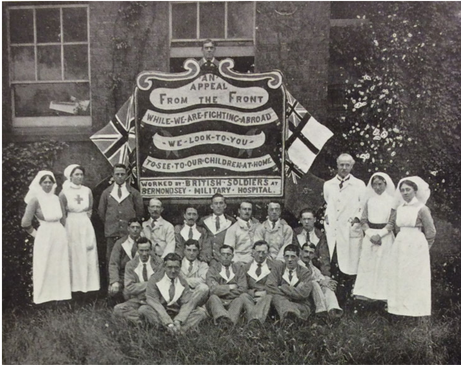
Figure 1: Banner made by soldiers at the Bermondsey Military Hospital and exhibited at the Central Hall, Westminster, during the 1917 National Baby Week: Report of the National Baby Week Council (London: National Baby Week Council, 1917), 29, SA/HVA/F.3/3. Wellcome Library, London, after page 34.

with the duty of mothering foisted upon them. Women of all classes found common ground as they participated in this event, just as infant-welfare historian Richard Meckel observed in America. 56