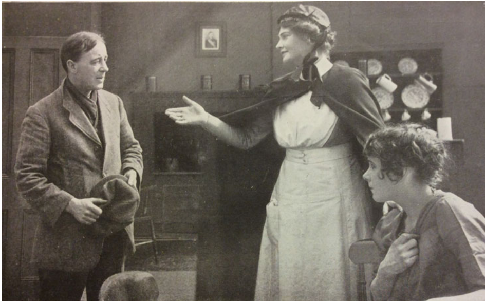
Figure 3: 'Scene from "Motherhood" film: THE HEALTH VISITOR [Irving] APPEARS ON THE SCENE: Published by kind permission of the Transatlantic Film Company': Report of the National Baby Week Council (London: National Baby Week Council, 1917), 29, SA/HVA/F.3/3. Wellcome Library, London, after page 20.