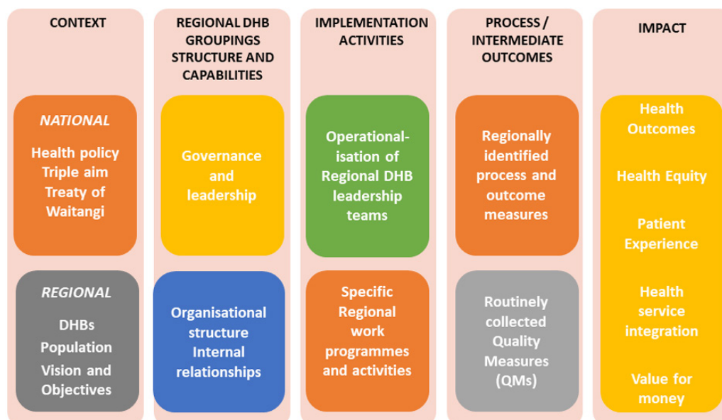
Figure 2 Draft preliminary logic model of regional District Health Board (DHB) working.

Documentary analysis 31 will be used to review publicly available central government, regional DHB and individual DHB documentation (eg, strategic plans, regional services plans and annual reports) as they relate to the current structure, capabilities and implementation activities of the four DHB regions. Members of the regional DHB governance groups and coordinating offices will be asked to advise whether the identified documentation best describes the organisational context and mechanisms for each DHB region and to identify and provide supplementary material as required. In terms of available quality measures all DHB regions will be reporting on SLMs 18 through their constituent DHBs. We will also determine what other quality measures are being reported and used at regional levels to assess performance across the domains of the NZ ‘Triple Aim’, 14 such as the HQSC’s quality and safety indicators 17 and any regionally developed outcome measures.