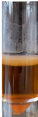
Figure 2. A bacterial cellulose “biofilm” being formed on the surface of a liquid medium.