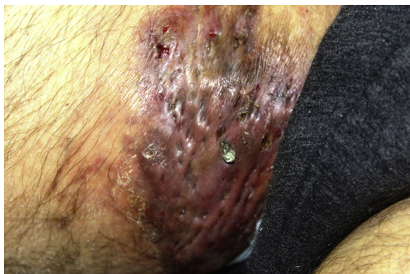
Fig 1. In a patient with HS, infiltrated inflammatory plaque affecting inguinal area.