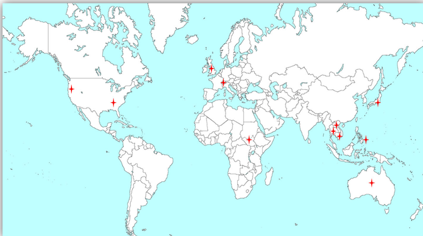
Figure 1. Geographic diversity and distribution of respondents in the study (red marks represent respondents' locations).

Most respondents described concerns about malaria elimination through MDA. They raised four types of issues related to