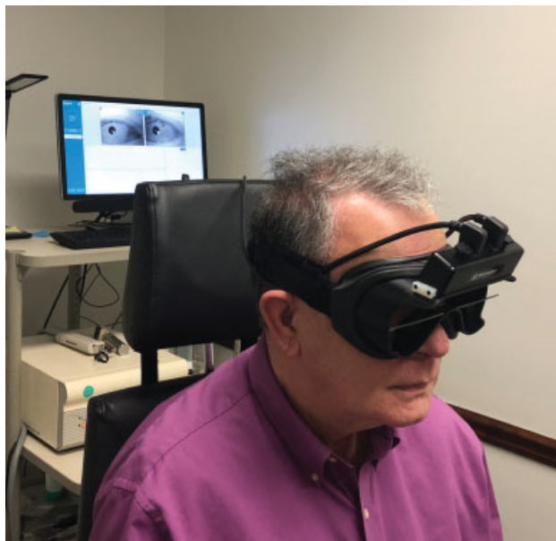
Figure 2 Rotary chair testing provides a true physiologic stimulus and is a more reliable indicator of peripheral vestibular function than are calorics.

The use of computerized and standardized postural stability tests is among the most sensitive in revealing the functional impairment caused by unilateral and bilateral vestibular loss. 11 Individuals with vestibular loss manifest with strong visual and surface preference. Simply put, they use their eyes and touch to manage their COG over a dynamic BOS. Computerized dynamic posturography (CDP) also has an additional sway-reference challenge which requires the patient to maintain their balance with a moving platform and visual surround which is responding to their movement. These standardized patterns can identify and differentiate normal versus vestibular and neurological descending