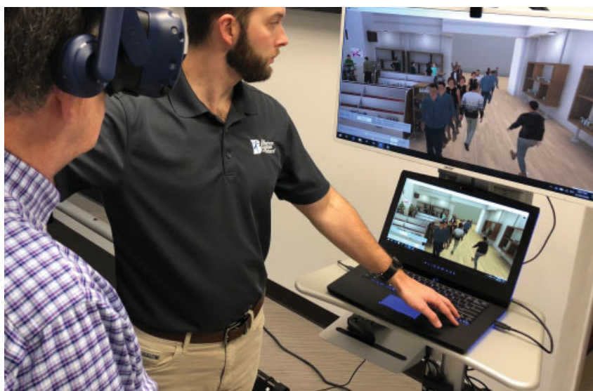
Figure 6 The use of virtual reality therapy plays an important role in helping patient's regain independence in everyday situations.