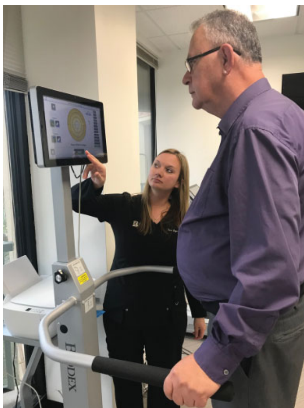
Figure 5 The use of interactive balance therapy protocols may accelerate the patient's ability to ambulate safely post-vestibular loss.