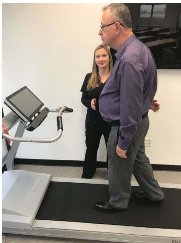
Figure 4 Gait therapy for patients with bilateral vestibular loss often is used in reducing fall-risk.

seen in Figs 4 and 5, the use of technology providing feedback on maintaining their COG over a dynamic BOS forces improved postural stability and ability to ambulate safely. The recent introduction of virtual reality therapy, which provides a realistic and safe environment for the patient, is showing great promise as a successful intervention tool. 12 Fig. 6 shows an individual participating in a virtual reality session as part of their balance therapy program.