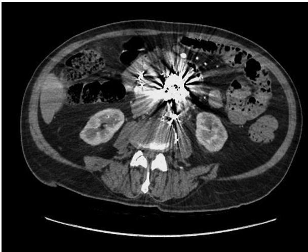
Figure 1. Computed tomography scan of the embolization material and endocoils inside the aneurysm sac.

A 75-year-old male with a three-month history of intermittent melena and a 40 g/L decrease in hemoglobin was referred to gastroenterology for further investigation. His surgical history was significant for an elective percutaneous endovascular aneurysm repair five years ago, complicated by a recurrent Type 2 endoleak, requiring a total of four trans-arterial and trans-lumbar embolization with copolymers, gelfoam, and endocoils. Computed tomography (CT) scan demonstrated a stable aneurysm sac diameter with no disruption of the aneurysm wall, extravasation of contrast material into the bowel, or signs of perigraft gas (Figure 1). On esophagogastroduodenoscopy (EGD), an aortoenteric fistula secondary to a perforating endocoil was seen in the third part of the duodenum (Figure 2), which was confirmed during a subsequent duodenal diversion procedure.