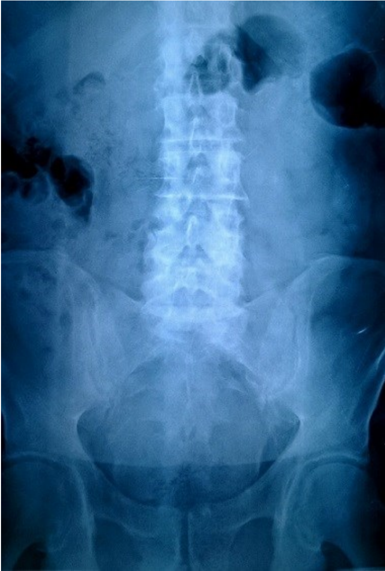
Figure 1: abdominal X-ray showing a faecal mass in the rectum