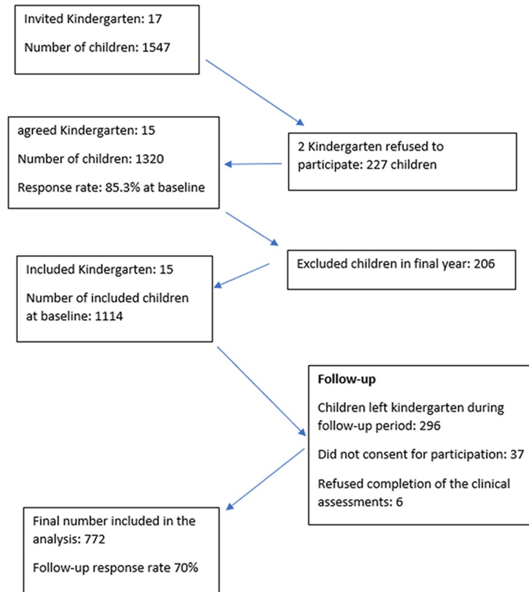
Fig 1. Flowchart of participation at baseline and follow-up.

https://doi.org/10.1371/journal.pone.0216227.g001