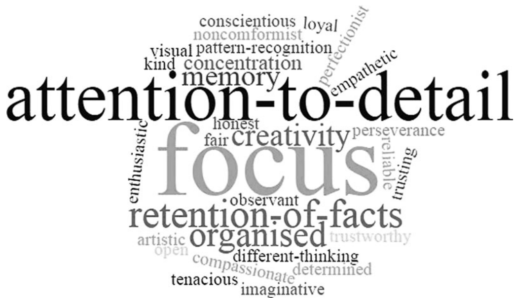
FIG. 1. Word cloud showing advantageous traits as described by participants.