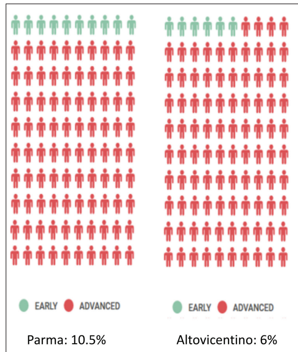
Figure 2. Early diagnosis rates in Altovicentino and Parma district study groups.

Conclusion: As as it is possible to understand