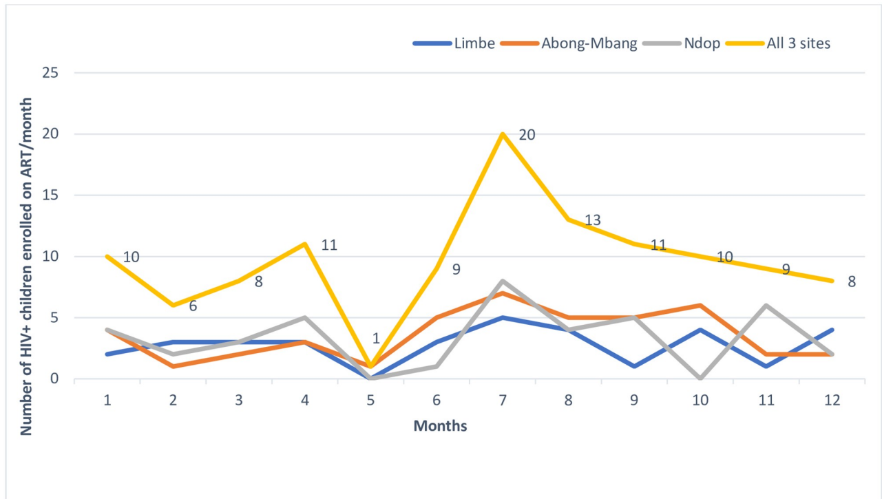
Fig 3. Trends in the number of HIV+ children/adolescents enrolled on ART before and after the intervention.

https://doi.org/10.1371/journal.pone.0214251.g003