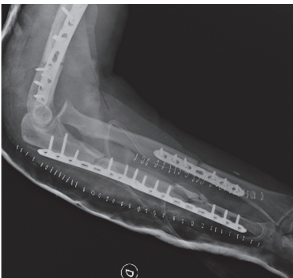
Figure 1. The persistence of the radial head dislocation relapse at the 4-week x-rays follow-up

Four weeks later, at the K-wire removal, X-rays revealed the radial head dislocation relapse (Fig. 1). The skin wound at the open fracture site was completely healed, and laboratory tests showed no signs of infection. Therefore, the patient underwent second surgery in order to obtain the anatomical reduction of the forearm fracture. TEN nails were removed and definitive fixation was performed using plates. No signs of PRUJ instability was apparently found during the intra-operative dynamic tests. Unexpectedly, the post-operative x-rays showed the persistence of the radial head dislocation.