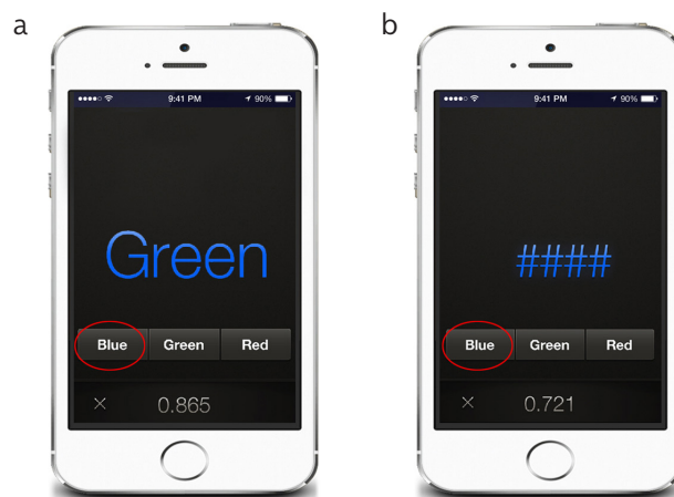
Figure 3. a, b. The ideograph of the EncephalApp Stroop App. (a) Subjects should correctly press the color corresponding to the that of the presented symbols. (b) Subjects should correctly press the color corresponding to the that of the presented word

With the popularity of smartphones, blood glucose and blood pressure can be monitored using relevant applications. In 2013, Bajaj et al. (23) developed an application, the EncephalApp Stroop App, for screening MHE that is operated by the iOS system on the iPhone and iPad. The core of this innovative application is the Stroop test, which evaluates psychomotor speed and cognitive alertness by measuring the time required to correctly identify a series of symbols and printed words with different colors (Figure 3). The EncephalApp Stroop App has been translated into several languages, including English, German, and Chinese, and this application and its operation-