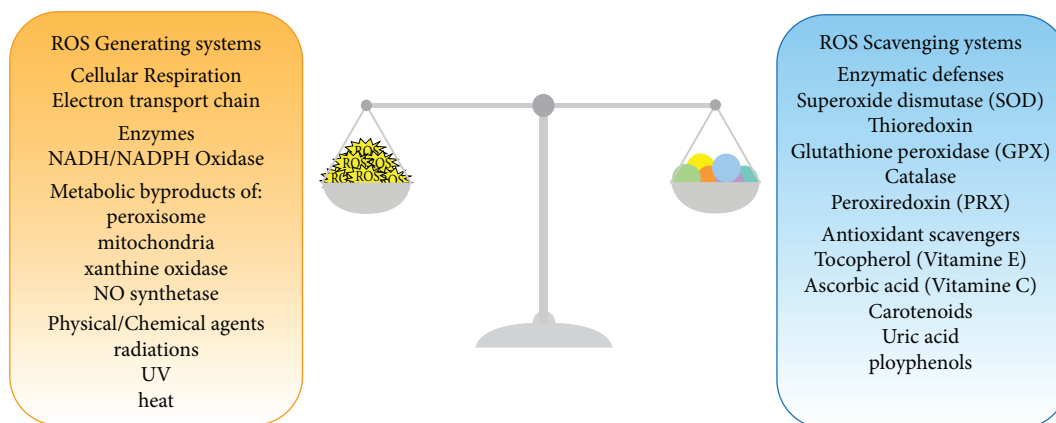
FIGURE 2: ROS production and scavenging systems. In physiological conditions, the balance between ROS generation and ROS scavenging is highly controlled. The energy production pathways (TCA cycle and OXPHOS), enzymatic reactions, by-products of metabolic pathways, and physical or chemical agents can lead to ROS production. As for the ROS-scavenging mechanisms, enzymatic defences and antioxidant scavengers neutralize the free radical reactions. When an imbalance between ROS production and ROS scavenging occurs, cells undergo oxidative stress, leading to severe cellular damage, cell death, and consequently whole organ and organism failure.

phosphate concentrations, and low adenine nucleotide concentration, is an essential permissive factor for mPTP opening [55]. This event triggers the so-called mitochondrial permeability transition that is characterized by a dramatic increase in the mitochondrial membrane permeability to any molecule smaller than 1.5 kDa. The consequent dissipation of the mitochondrial \Delta\Psi_m leads to membrane depolarization and mitochondrial swelling, increased mitochondrial reactive oxygen species (mROS) generation, cytochrome c release, and apoptosis [55].