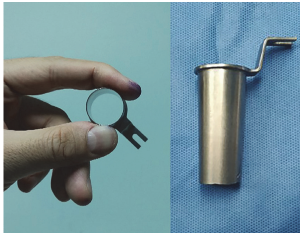
FIGURE 1: Zista tapered retractor is 22 mm in diameter on the upper end and tapers to a diameter of 18 mm at the opposite end.