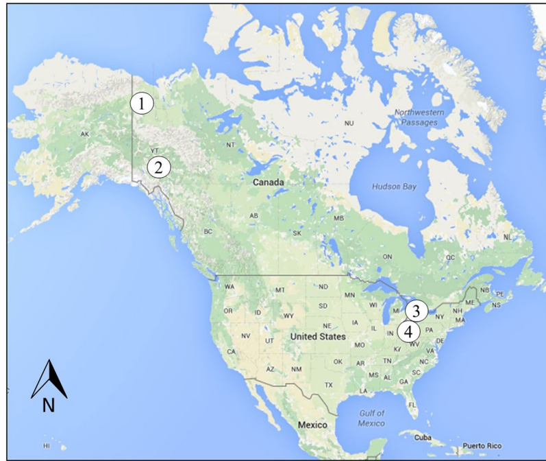
Figure 1. Terrain map of North America indicating sample collection sites. 1 – Old Crow, Yukon Territory, Canada. 2 – Whitehorse, Yukon Territory, Canada. 3 – Pinery Provincial Park and London Area, Ontario, Canada. 4 – Ohio, United States of America. Map data from Google, INEGI, 2019.

purpose of lodge and dam building 25 . The bulk of its diet would have been foliage from deciduous trees and its engineering habits would have promoted local biotic diversity and significantly impacted the hydrological patterns of the Pleistocene landscape.