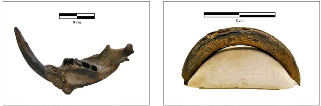
Figure 4. Left: A near-complete Castoroides ohioensis mandible and lower incisor from Clear Creek Township, Ohio, USA. Specimen OHS N9109. Right: A complete Castoroides ohioensis upper incisor from Old Crow, Yukon Territory, Canada. Specimen CMN 51270.

the extinction of the genus 1,17–19,65,66 . The giant beaver disappeared from Eastern North America shortly before the Pleistocene–Holocene transition 6 . With the disappearance of this population, the genus became globally extinct.