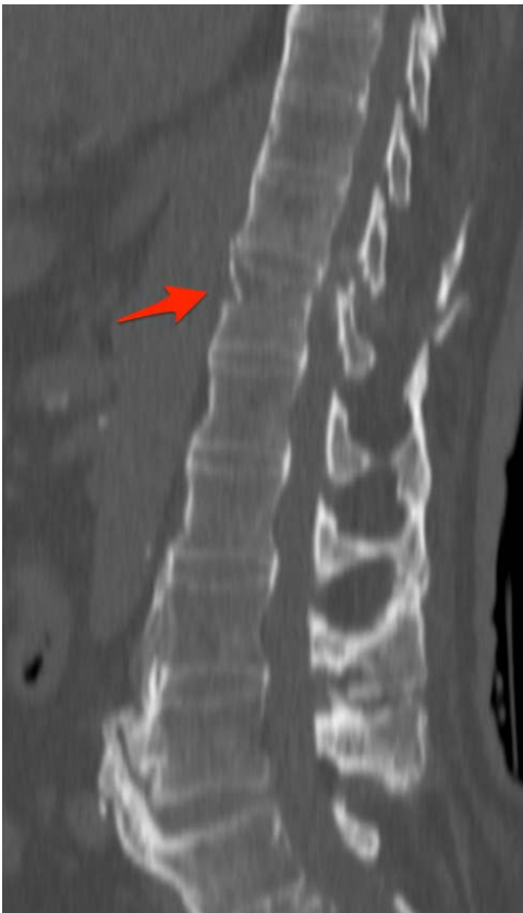
Figure 7. Computed tomography sagittal section showing fracture T12 involving all 3 columns (Case 2).

ma. 5,6 The spinal fractures involve all 3 columns secondary to hyperextension injuries and behave like Chance fractures. 7 The horizontal fracture line can run through vertebral body (bony Chance) or disc space (soft tissue Chance). 8 Following the injury, the traumatic force acts on the long lever arm of ankylosed spine which behaves like a long extremity bone. 3,9