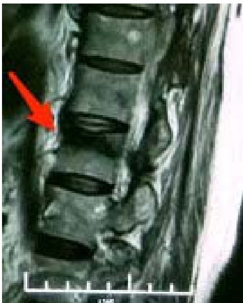
Figure 2. T2 sagittal magnetic resonance imaging showing hyperintense signal adjacent to superior end-plate of T12 vertebra indicating a fracture (Case 1).

the pedicles under fluoroscopic guidance and about 3 mL of bone cement was injected into the void (Figure 3). Appropriate precautions were taken to prevent cement leakage which included cement injection as anteriorly as possible (Figure 4) and turning the patient only after cement hardening. Postoperatively the patient was encouraged to resume walking 4 hours after the procedure with brace support (Figure 5). Follow-up CT showed adequate filling of the fracture site with bone cement (Figure 6) and excellent improvement in ODI and VAS scores were sustained at 2 years (Table).