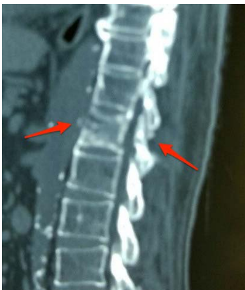
Figure 1. Sagittal computed tomography image showing a 3-column fracture of T12 in ankylosing spondylitis (Case 1).

the pedicles under fluoroscopic guidance and about 3 mL of bone cement was injected into the void (Figure 3). Appropriate precautions were taken to prevent cement leakage which included cement injection as anteriorly as possible (Figure 4) and turning the patient only after cement hardening. Postoperatively the patient was encouraged to resume walking 4 hours after the procedure with brace support (Figure 5). Follow-up CT showed adequate filling of the fracture site with bone cement (Figure 6) and excellent improvement in ODI and VAS scores were sustained at 2 years (Table).