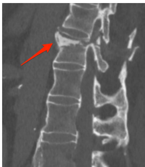
Figure 6. 2-year follow-up computed tomography sagittal image (Case 1).

Abbreviations: ODI, Oswestry Disability Index; VAS, visual analog scale.