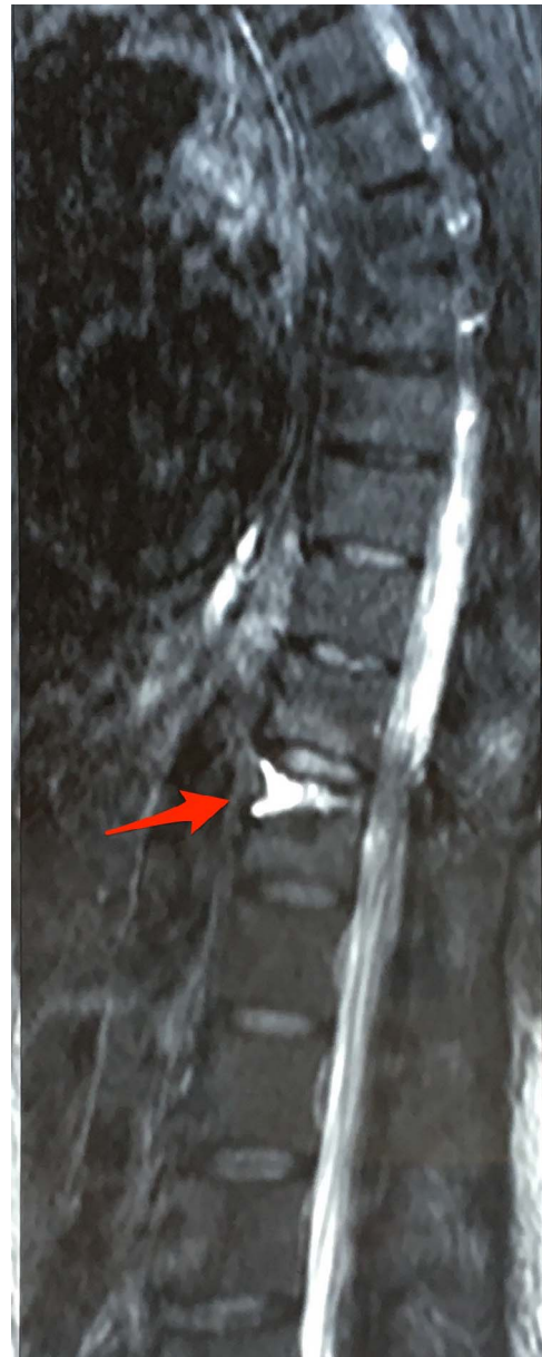
Figure 8. T2-weighted sagittal magnetic resonance imaging showing pseudoarthrosis (Case 2).

In view of the focal instability at the fracture most surgeons/doctors advocate long-segment instrumented fusion. 3,6,10 Generally, the mortality of surgically-treated AS patients is higher than the normal population sustaining spinal trauma. 6 Again, in patients with AS who are medically unfit for surgery, the issues related to management are further complicated in the absence of any set protocol. Brace treatment has been attempted in such cases with questionable relief and poor results. 6,11,12 Specifically, brace treatment in AS patients has high incidence of pseudoarthrosis and consequent pain leading to delay in mobilization, which adds to the morbidity. 6,13-15 Strategies to deal with such patients with persistent pain and high medical comorbidities that preclude surgery are lacking in the literature.