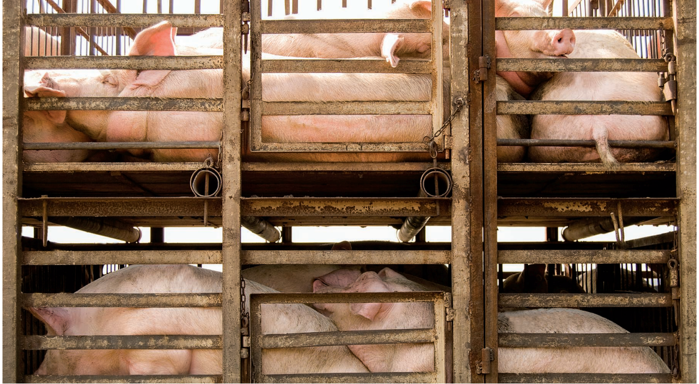
Pigs in cages, Quanzhou, China. As the largest consumer of veterinary antimicrobials, China is critical for combating antimicrobial resistance (AMR).

[118 mg/PCU and 133 mg/kg, respectively (14)], but given that the biomass of animals raised for food exceeds by far the biomass of humans, new resistant mutations are more likely to arise in animals. Furthermore, a central distinction between animals and humans is the purpose of antimicrobial use. Unlike in humans, antimicrobial use in animals is primarily intended for growth promotion and mass prophylaxis. These uses are often administered both through feed, directly targeting the gut, and in low-dose patterns that promote the evolution of resistance (15). These factors suggest that the food animal reservoir is a greater source of resistance genes than humans. However, the subsequent spread of those genes to humans follows complex pathways, and recent work has highlighted that curtailing antimicrobial use in animals alone will not suffice to contain AMR in humans (16).