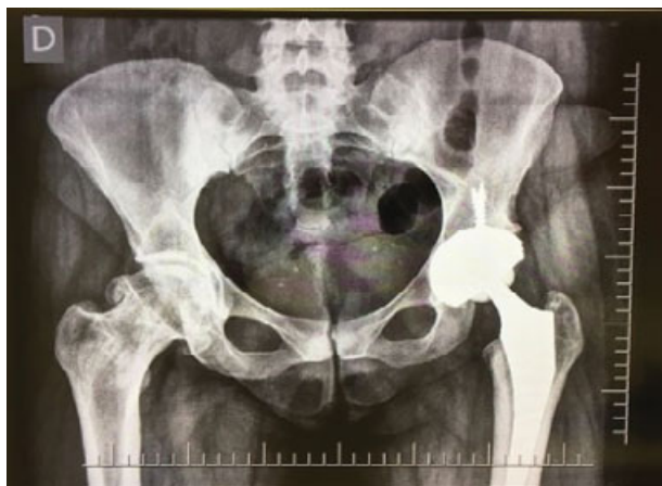
Fig. 3 Demonstrative photograph of residual dysmetria in postoperative malleolar evaluation.

Gluteus maximus tenotomy is described for the treatment of deep gluteal pain, which can result from non-discogenic compression (sciatic nerve compression). 5 The description of this procedure as a protective measure against sciatic nerve injury during THA (as presented by the authors) requires studies with greater scientific evidence. Nevertheless, the electro-neurophysiological results presented here support us to stimulate large centers in performing prospective clinical studies to ratify these results.