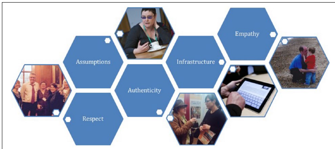
Figure 1. Current topics in participatory autism research.