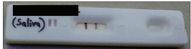
Figure 1: Test kit showing a dark band (positive)

Detection of pregnancy is based on the measurement of hCG and its variants. In a normal menstrual cycle, ovulation occurs on an average of 14 days before the next anticipated menses, and the corpus luteum then starts to develop. If the oocyte is fertilized, implantation takes place approximately during the next 7 days, resulting in an increase in the concentrations of