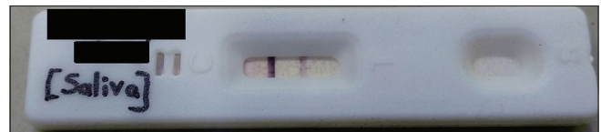
Figure 2: Test kit showing a light band (positive)