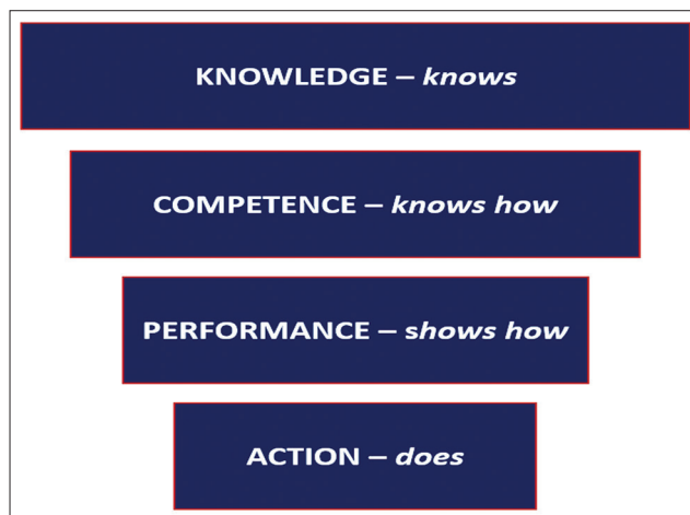
Figure 3: A representation of Miller's four-stage framework for clinical competence: action, performance, competence itself, and knowledge [54]

Aiming to evaluate not only knowledge but also decision-making and clinical reasoning, these – usually – multiple choice tests