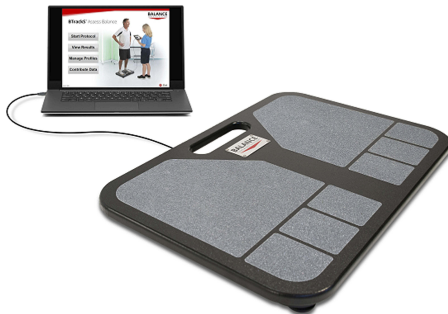
Figure 1 Testing materials for this study included the BTrackS Balance Plate (right) and BTrackS Assess Balance software running on a laptop (left).

In line with the above instructions, participants stood on the plate for four testing trials (one in each of four