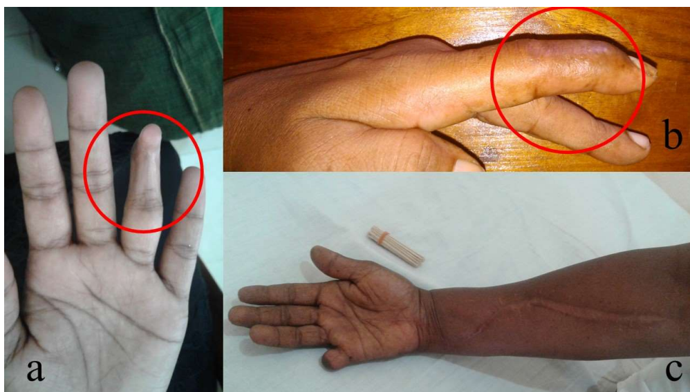
Figure 1. Various long-term local effects of the bites by Merrem’s hump-nosed pit viper ( Hypnale hypnale ) in Sri Lanka: (a) a contracture deformity involving the distal interphalangeal joint of the ring finger in left hand (red circle); (b) a contracture deformity involving the distal interphalangeal joint of the index finger in left hand (red circle); and (c) amputation of the right little finger due to local necrosis with the fasciotomy due to compartment syndrome of the right forearm. (All photographs are published with permission of the patients).

Therefore, not only the consequences of severe local effects, but also the burden due to mild long-term local effects are important in snakebite survivors and need to be addressed (Figure 1).