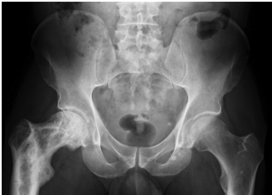
Fig. 1. X-ray features of PDB. Pelvic radiograph from a patient with PDB affecting the upper right femur showing alternating areas of osteolysis and osteosclerosis in the greater and lesser trochanters and femoral neck; loss of distinction between the cortex and medulla in the upper femur; bone expansion and deformity of the affected femur; and a pseudofracture on the lateral aspect of the femur opposite the lesser trochanter.