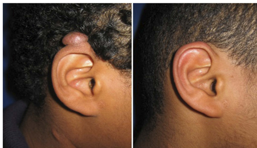
Figure 2 Auricular keloid. Before and after treatment result at 2-year follow-up.

The risk of carcinogenesis due to radiotherapy is the main reason for current disagreement regarding its use as an adjuvant treatment of keloids. Indeed, there does exist a low stochastic risk of radiation-induced secondary cancers, even if only sporadic cases have been reported in the treatment of keloids with PORT. 40 Although Ragoowansi