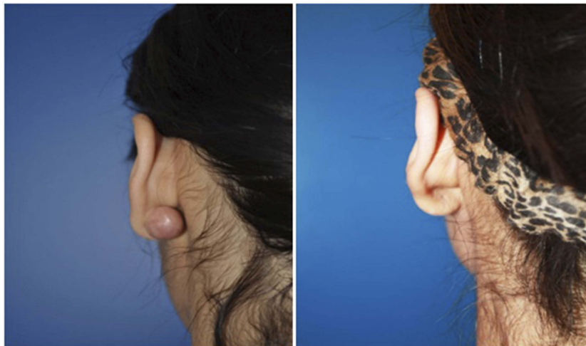
Figure 4 Auricular keloid. Before and after treatment result at 2-year follow-up.