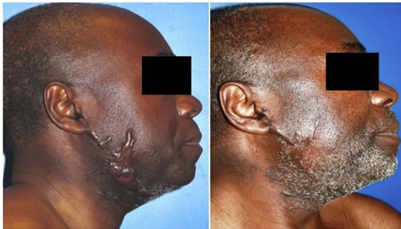
Figure 3 Jugal keloid. Before and after treatment result at 13 months' follow-up.