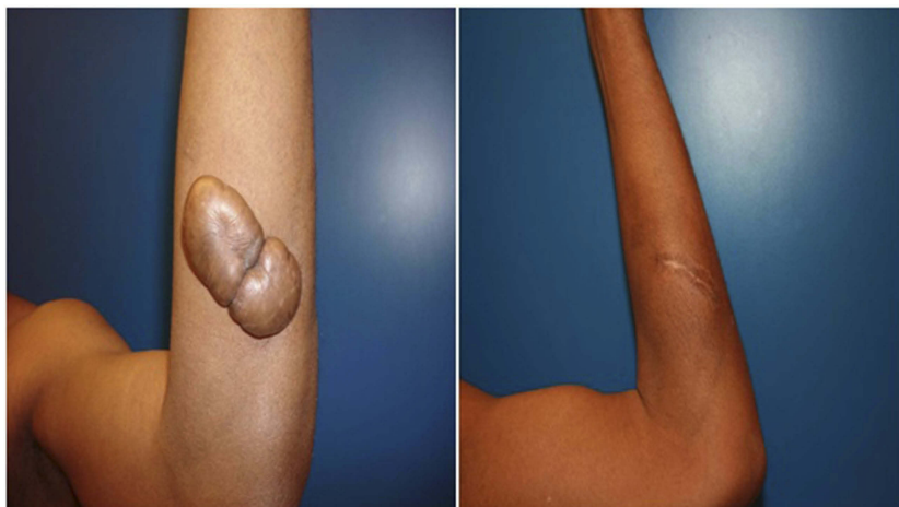
Figure 5 Forearm keloid. Before and after treatment result at 2-year follow-up.