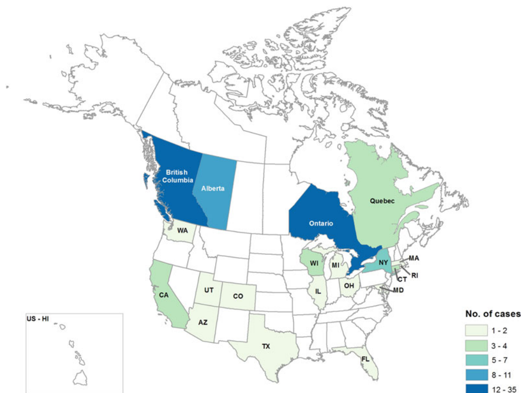
Fig. 2. Persons infected with the outbreak strains of Salmonella Newport, S. Hartford , S. Saintpaul , S. Oranienburg , and coinfecting with S. Newport and S. Hartford in the USA and Canada by state and province, 2013–2014, ( n = 94 ) (case count map) USA: Arizona (1), California (4), Colorado (1), Connecticut (3), Florida (1), Illinois (2), Maryland (1), Massachusetts (1), Michigan (1), New York (7), Ohio (1), Rhode Island (1), Texas (2), Utah (1), Washington (1), and Wisconsin (3); Canada: Ontario (35), British Columbia (14) Alberta (10), and Quebec (4).