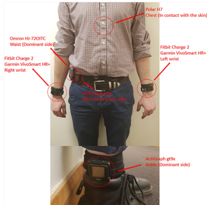
Fig 1. Devices positioning. Polar H7, Fitbit Charge 2, Garmin VivoSmart HR+, ActiGraph GT9X-BT, Omron HJ-720ITC. Philips Health Watch and Withings Pulse Ox are not illustrated in the picture but are worn in the same position of the Fitbit and Garmin devices.

https://doi.org/10.1371/journal.pone.0216891.g001