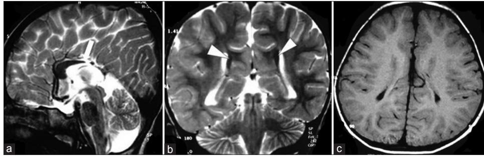
Figure 1: Cranial MRI, (a) Sagittal T2W MRI showing absent posterior body and splenium of corpus callosum (arrow), cingulate gyrus and the medial hemispheric sulci reaching up to the 3 rd ventricular surface. (b) Coronal T2WI showing Probst bundle indenting medial aspect of the body of lateral ventricles. (c) Axial T1WI showing parallel orientation of ventricles

hallmark of syndromic ASD. He also had moderate intellectual disability. Presence of partial AgCC could be understood as the proximal risk factor for the autistic symptoms. The absence of posterior body can explain his moderate autism as this is the region vital for self-referential and social cognitive development. [7] Presence of Probst bundle is further evidence of AgCC, as the white matter tract, which has failed to form interhemispheric connection, has instead remained in the longitudinal orientation. This structural evidence of partial disconnection of the corpus callosum can be considered causative of ASD symptoms in the index case.