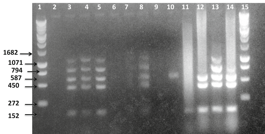
Fig. 1 Result of multiplex PCR conducted on Brucella isolates. Lanes 1 and 15, 1 Kb plus DNA ladder (Invitrogen); lane 2, negative control ( H_2O ); lanes 3–5 and lane 8, isolates of B. melitensis ; Lane 6, 7 9 and 10 negative samples; Lane 11–14, reference positive control (DNA from B. suis 1330 bv1, B. ovis 63/290, B. melitensis Rev.1 (vaccine strain) and B. abortus RB51)

RB51 and B. suis 1330 bv1 controls were also characterized by absence of 1071 bp and 1682 bp amplicons. In this experiment, B. suis 1330 bv1 control showed smearing of band except presence of amplicon of 152 bp which might be caused by degradation of DNA.