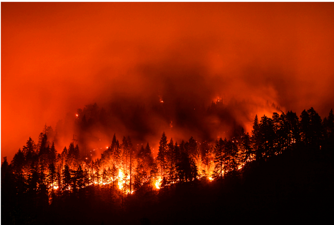
Fig. 1. Carbon-management policies would do well to use disturbance ecology to factor in tree mortality risk. For wildfire and other impactful disturbances, researchers now have the capability to incorporate these risks into policy mechanisms that enhance forest carbon storage. Doing so would substantially improve global forest carbon policies aimed at climate change mitigation.

What has been missing is the explicit use of disturbance ecology to factor in tree mortality risk. For wildfire and other impactful disturbances, our understanding is now sufficient to incorporate these risks into policy mechanisms that enhance forest carbon storage. Doing so would substantially improve global forest carbon policies aimed at climate-change mitigation.