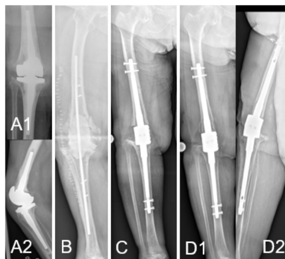
Figure 1. (A) Pre-operative X-ray with knee revision arthroplasty with cemented femoral and tibial stem anchorage without any obvious signs of loosening or osteolysis (A1: ap, A2: lateral). (B) After removal of the revision prosthesis intramedullary rods are placed in the femur and tibia with an antibiotic-loaded PMMA spacer to fill the large dead space as interim knee arthrodesis solution. Cortical windows were needed for complete bone cement removal, which were then fixed with screws. (C) Postoperative ap-view after modular knee arthrodesis with metallic silver coating and connection of the intramedullary femoral and tibial components with a spacer and locking bolts. Intramedullary rods were fixed cementless. (D) 26 months control after modular knee arthrodesis no implant loosening could be evidenced on both ap (D1) and lateral (D2) view.

Knee arthrodesis surgery was carried out three months after the removal of the prosthesis and the silver coated arthrodesis device was implanted without any problems (Fig. 3B). Samples taken during this revision also remained sterile and postoperative X-rays showed correct implantation of the knee arthrodesis device (Fig. 1C).