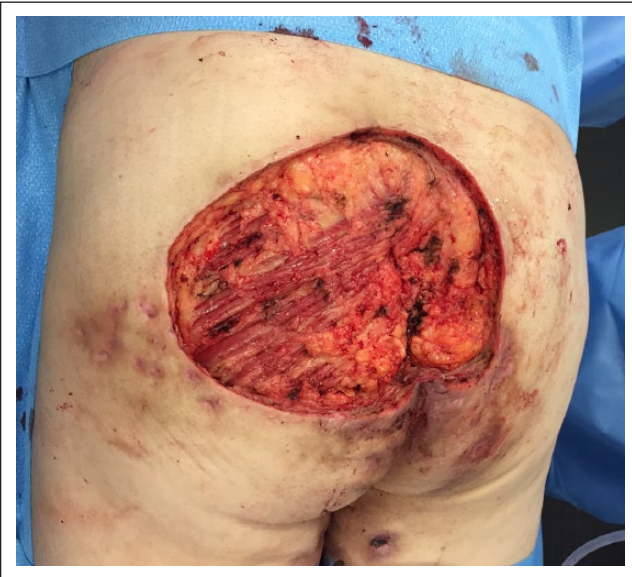
Figure 2. Surgical resection extending to the level of the deep fascia.

undifferentiated tumor than what was observed 2 months prior upon first resection at the community hospital. Indeed, microscopy now showed an infiltrating poorly differentiated SCC composed of islands of atypical sarcomatoid spindle cells (Figure 3), staining positive for CK5/6, CKAE1/AE3, p63, and vimentin. Numerous mitoses were noted. Melanoma was ruled out as S100, and Melan-A were negative. CD34, CD31, desmin, and p16 were also negative. There was no vascular or lymphatic invasion. Surgical margins were positive at the level of the intergluteal cleft, and a third resection was scheduled. Unfortunately, the patient died shortly after from pulmonary metastases.