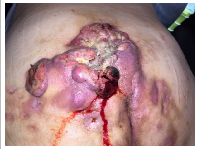
Figure 1. Violaceous exophytic mass arising within the surgical wound.