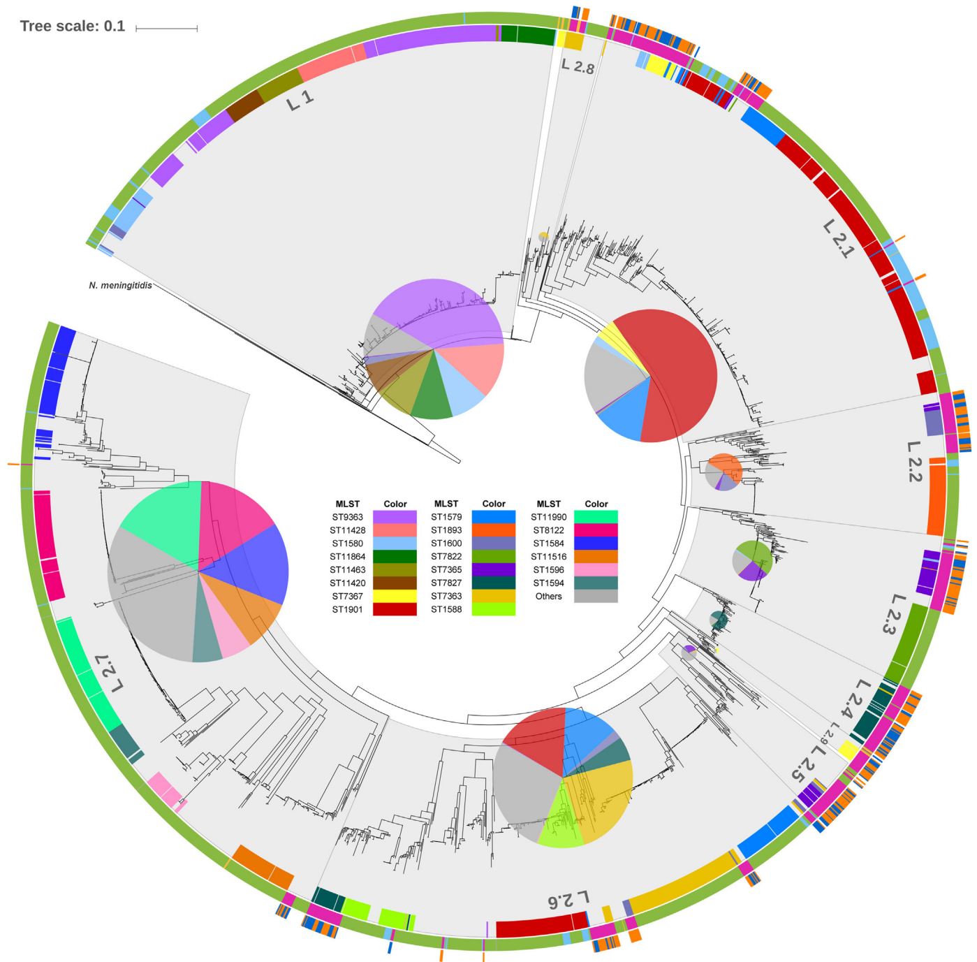
Fig. 2. Phylogenetic analysis. Four representative strains of N. meningitidis were included as outgroups. Maximum-likelihood tree of 2512 N. gonorrhoeae isolates based on 69,374 genome-wide SNP sites. Four representative strains of N. meningitidis (Z2491, MC58, FAM18 and 053442) were used as outgroups. Lineage 1 (L1) and 9 sub-lineages of lineage 2 (L2) are marked with background shadows. The proportions of predominate MLST types of each lineage/sub-lineage are highlighted by internal pie charts with size proportional to the total number of isolates. The external color strips range from 1 (inner) to 3 (outer). Strip 1, isolates with predominate MLST types of the current dataset. Strip 2, origin of each strain with color code for countries: deep pink, China; sky blue, USA; light green, UK. Strip 3, distribution of N. gonorrhoeae strains isolated from southeast (orange) and northwest (blue) of China. The scale is in the units of mutations per site.

As a key technology for providing a far greater degree of resolution and ruling out potential transmission links that may be inferred by the