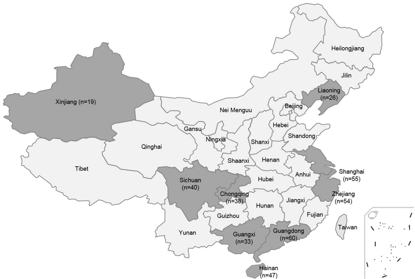
Fig. 1. Geographic locations of the provinces where the N. gonorrhoeae isolates were collected for the study. The number of isolates from each province is given in parentheses.

4287 N. gonorrhoeae isolates in PubMLST database, eBURST analysis was conducted. 566 identified STs could be subdivided into six groups and most of which (517/566) were found in group 1. In group 1, ST1901, the predominant ST in the US, was predicted as the founding genotype, but was not found in our population (Fig. S2). There were 284 NG-MAST STs (including 4 new NG-MAST STs) identified in our study and the most prevalent STs were NG-MAST ST2318 ( n = 17 ), followed by ST4846 ( n = 9 ), ST2083 ( n = 8 ) and ST1866 ( n = 7 ).