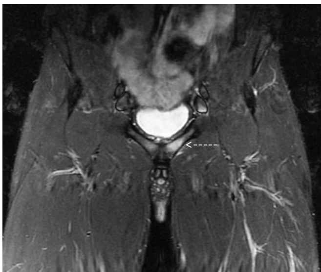
Figure 3 An MRI (STIR sequence) of symptomatic soccer player groin. Grade III bone marrow oedema (arrow) is demonstrated in the left pubic symphysis with an adductor longus injury (bright signal below pubic bone).

We still need well-designed controlled studies to find out how many asymptomatic athletes have adductor-related changes in MRI or weakness of the posterior wall without any relation of groin pain ever. 26 27