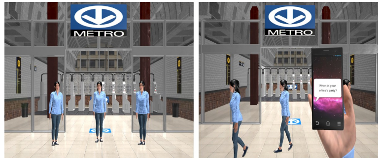
Fig 1. Virtual subway station as seen by the participants through the helmet mounted display. On the left, the picture represents the three virtual humans at the beginning of the trial. The picture on the right represents a condition where a text message was displayed on the screen of a virtual phone during a catch trial (all avatars moving away).

https://doi.org/10.1371/journal.pone.0217062.g001