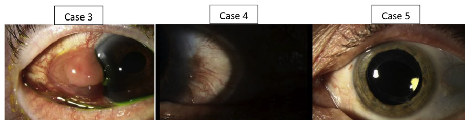
Fig. 2. Clinical pictures of initial presentation of three cases with margins positive for invasive melanoma after initial excision, with recurrence of disease and subsequent requirement for additional surgery after use of topical adjunctive IFN- \alpha 2b.

59-year-old female presenting for recurrent melanoma of the nasal bulbar conjunctiva (Fig. 2). She had a previous biopsy that showed invasive melanoma at all surgical borders. One month later, she was evaluated at the University of Iowa. At time of evaluation, she was noted to have a nasal 1.5 mm by 1.7 mm pigmented bulbar lesion. After discussion, the patient elected to treat initially with IFN- \alpha 2B. She underwent a 3-month course of IFN- \alpha 2B. There was no change in