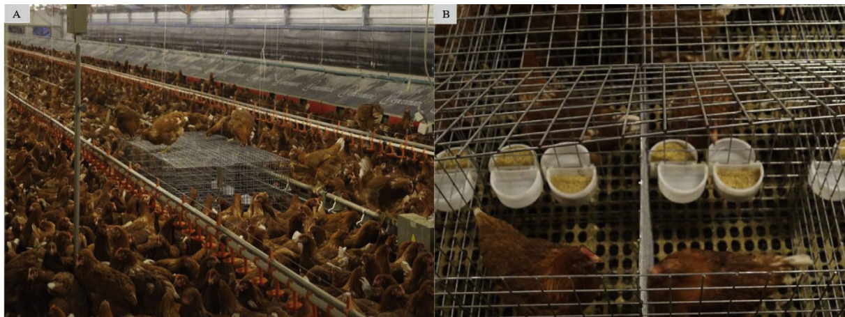
Fig. 2. (A) Hens being placed in the cage unit for evaluation of individual feed intake and feeding behaviour; (B) individual hens were confined for 24 h in individual holding pens with 250 g mesh feed and ad libitum water.