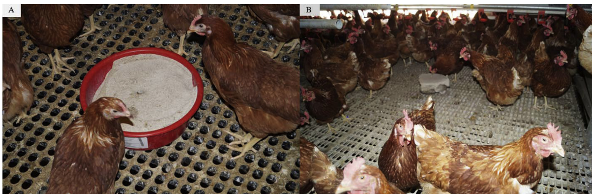
Fig. 1. Pecking stones inside the housing facilities of a treatment flock (A) 2 days and (B) 10 weeks after being placed.

A cage consisting of 10 individual holding pens was used to monitor individual hen feed intake and feed selection. The cage was placed in the middle of the poultry house before flock placement to minimise stress associated with placement of novel equipment ( Fig. 2 ). At each time point (starting when hens were 16 weeks of age and continuing at 26, 36 and 46 weeks of age), 10 hens were randomly selected from the control and treatment groups and placed individually in the holding pen of a cage with 250 g of mash feed per hen with water ad libitum . The feed was